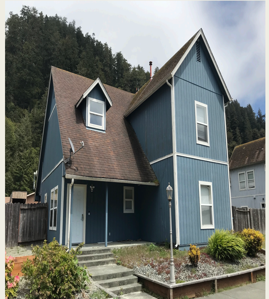
Coming Home House